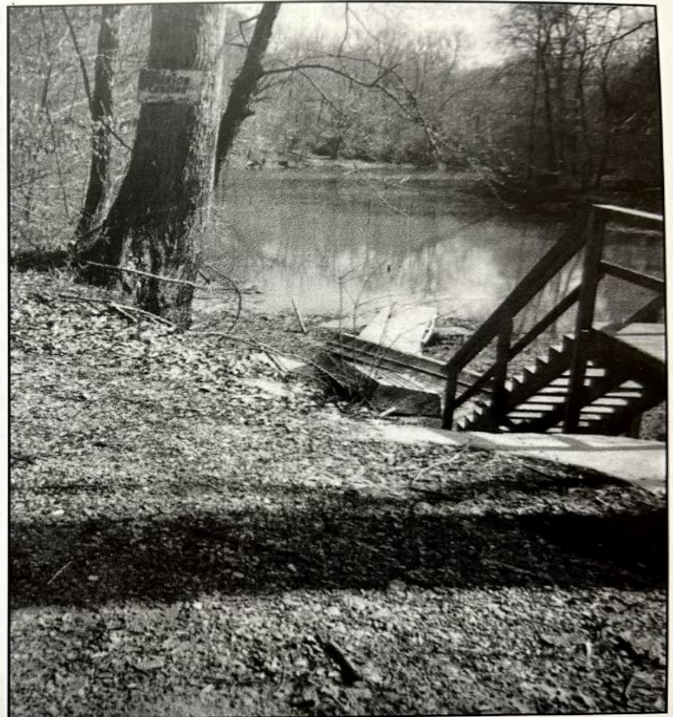
Picture of Lake Conwill a few feet from where the 1933 picture was taken. The sign on the tree says, "Johnson Landing 1830-1860."

Below: A picture taken May 19, 2023 at the Johnson Landing site of members attending the first Nettleton Club Day.