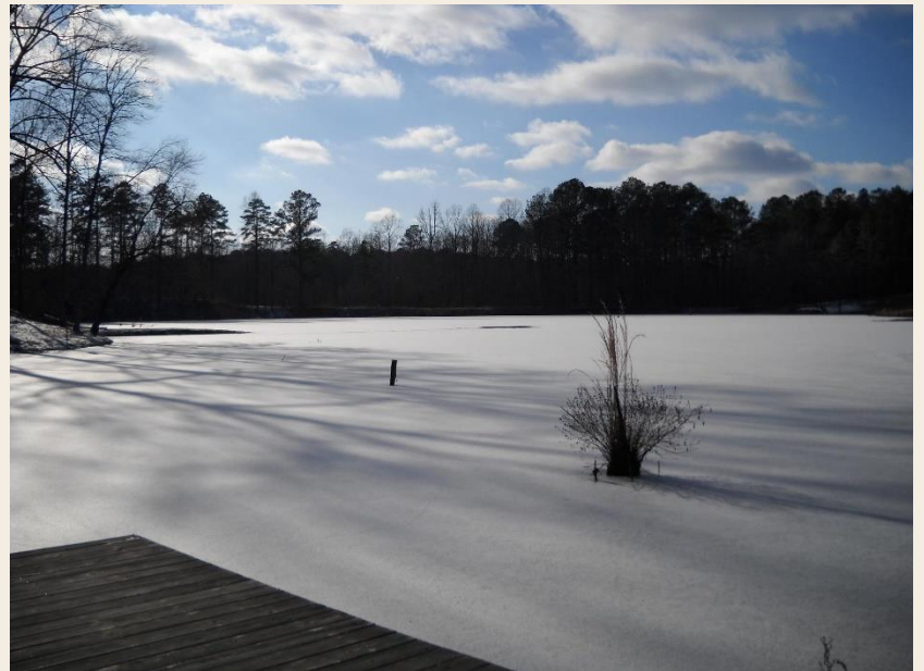
Lake Thomas frozen over January 9, 2010.

Please send your photos to Russell Taylor at 662-507-8161